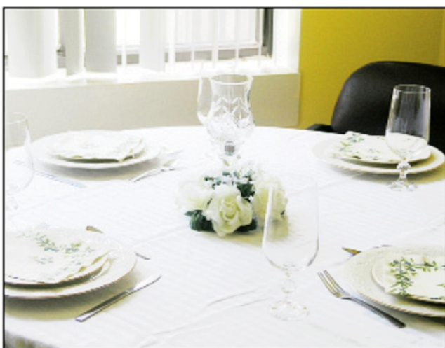
Pictured is a dining table at Cobb Healthcare Center in Comer.

For more information on volunteering at Cobb Healthcare or to inquire about their services, call 706-783-5116.